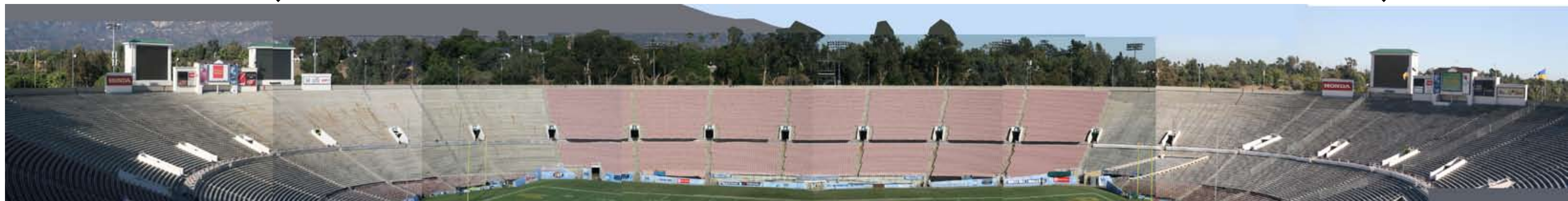
Scoreboard : Existing Condition